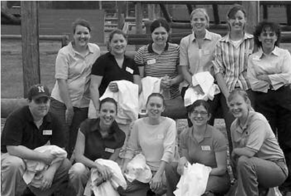
SU physical therapist students and faculty at the "O" course (Obstacle) at the Quantico Marine Base.